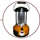
Solar LED Lantern