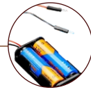
Hyper Sell Chamber